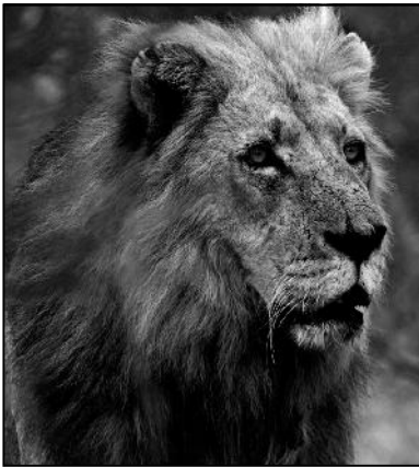
Old warrior—Neil Guthrie