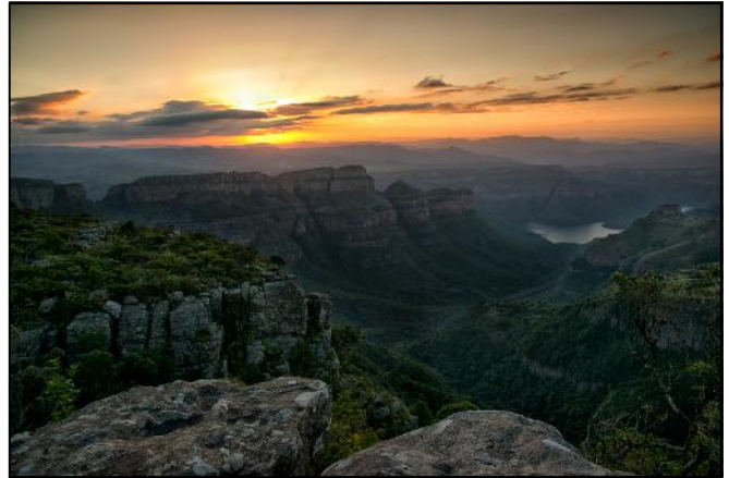
Groen vallei—Annelize Habig