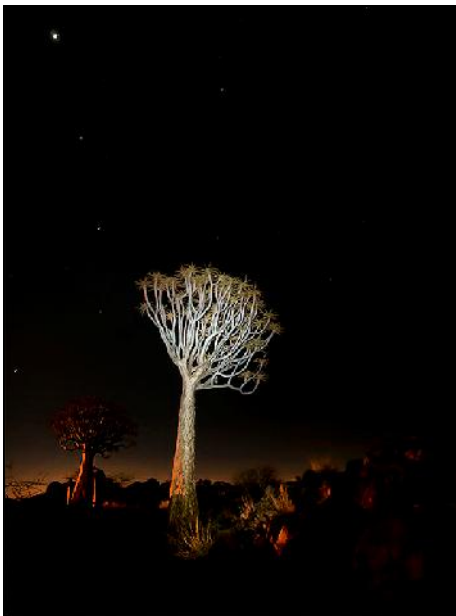
Paint by light quiver tree Ian Crook - Best in section