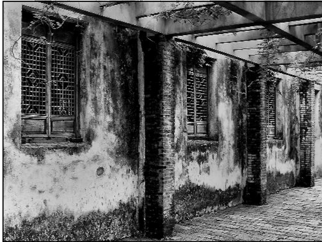
Old building—Sadie Glibbery